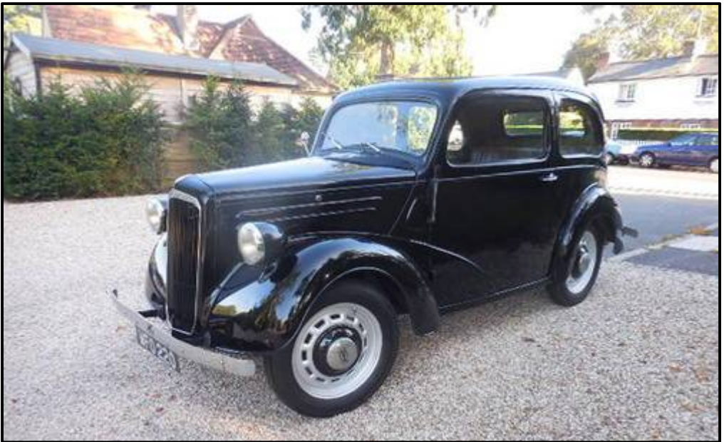
The Ford Anglia (type EO4A I think) of the sort I rode in during the early 1950s around the Gosport area. A rare car today.