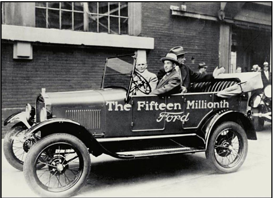
A Model T tourer not unlike the one I remember from the late 1940s in Shanklin.