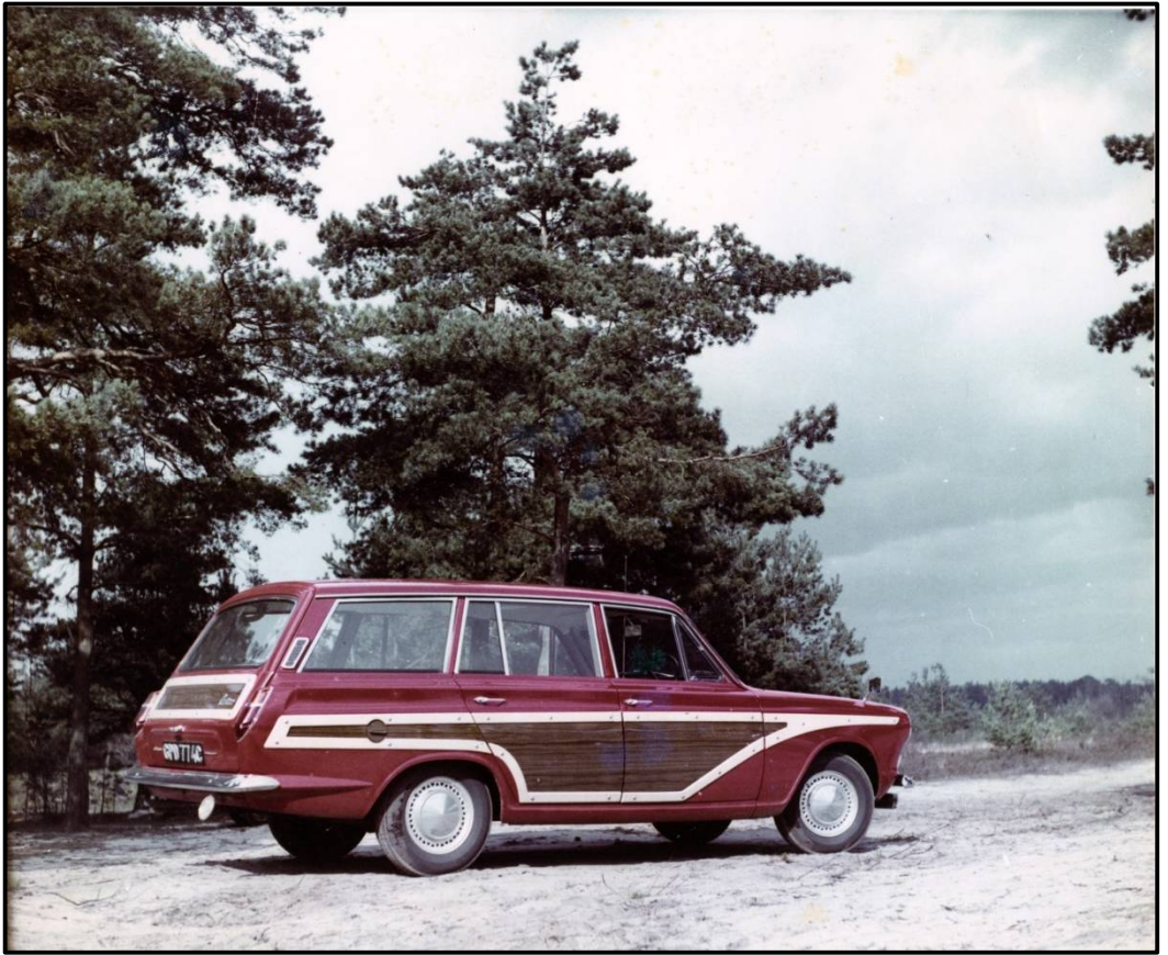
Smart Cortina Woody! Very rare now and a good one is worth many thousands