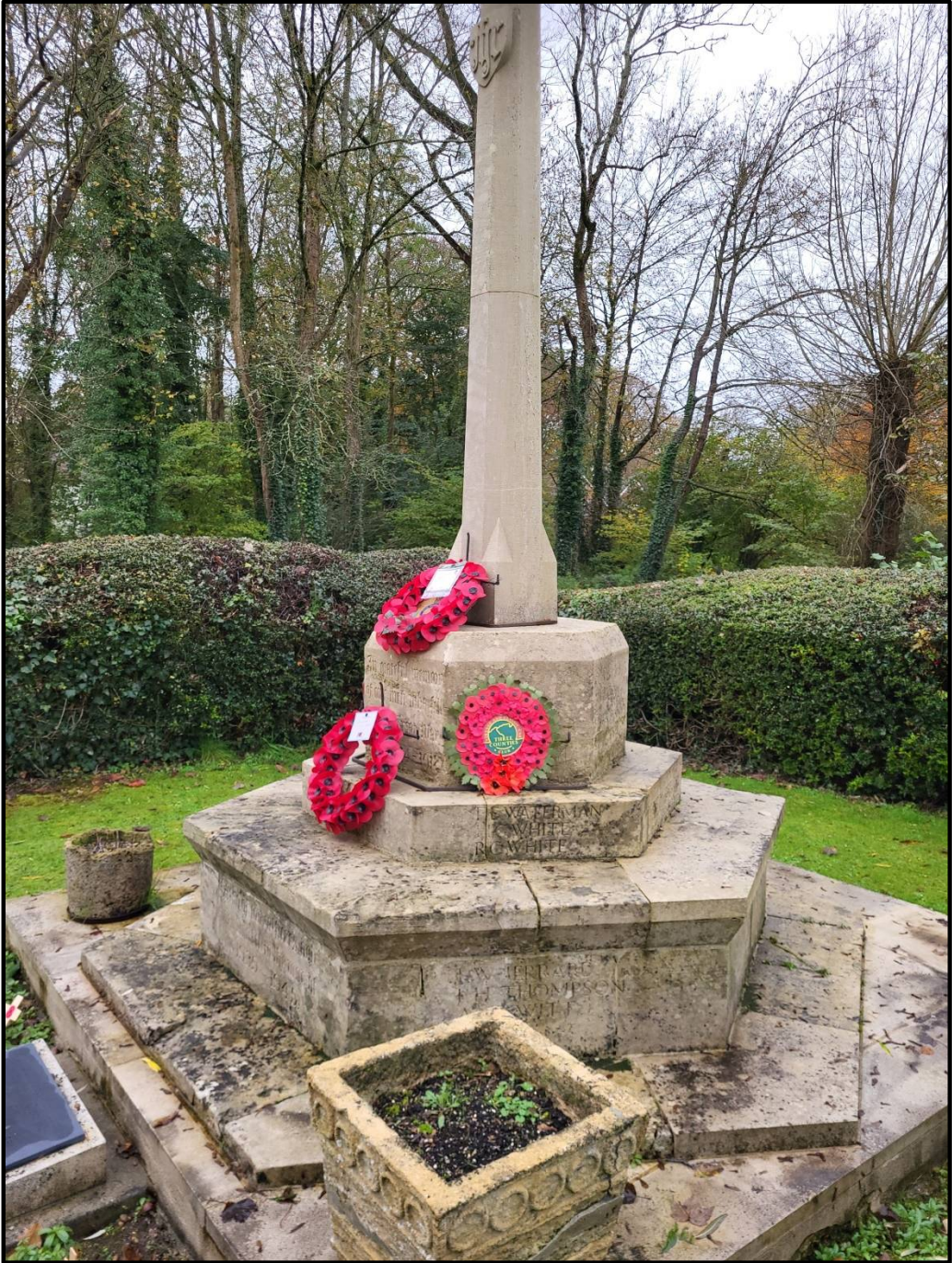
The club wreath in position on the Damerham War Memorial